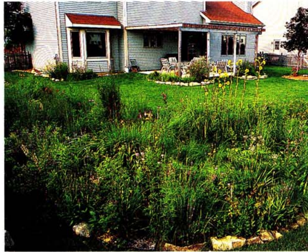
Nature in your yard is an adventure. "Expect surprises," writes author Jack Broughton.

To direct water from the downspout or sump pump outlet, simply dig a shallow trench to the rain garden and bury a 4-inch black plastic drainage tube that connects with positive drainage from the outlet to the depressional area.