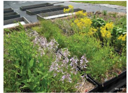
1 st Trial Set Second Year Weigh-in