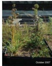
1 st Trial Set Supplemental Watering